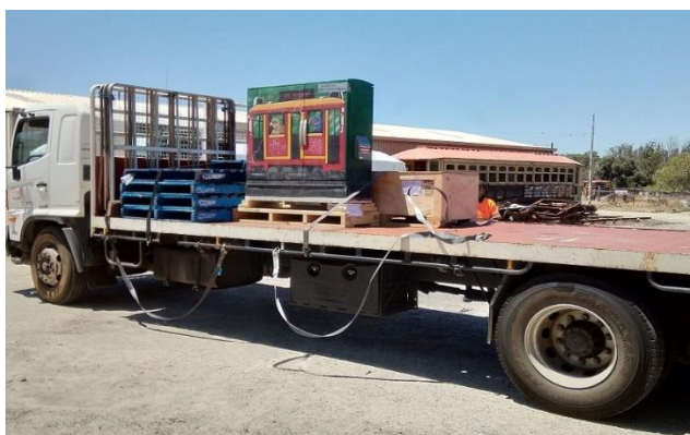
The consignment arrives. The Lindsay Richardson Body barn with WAGT E Class 64 is behind.