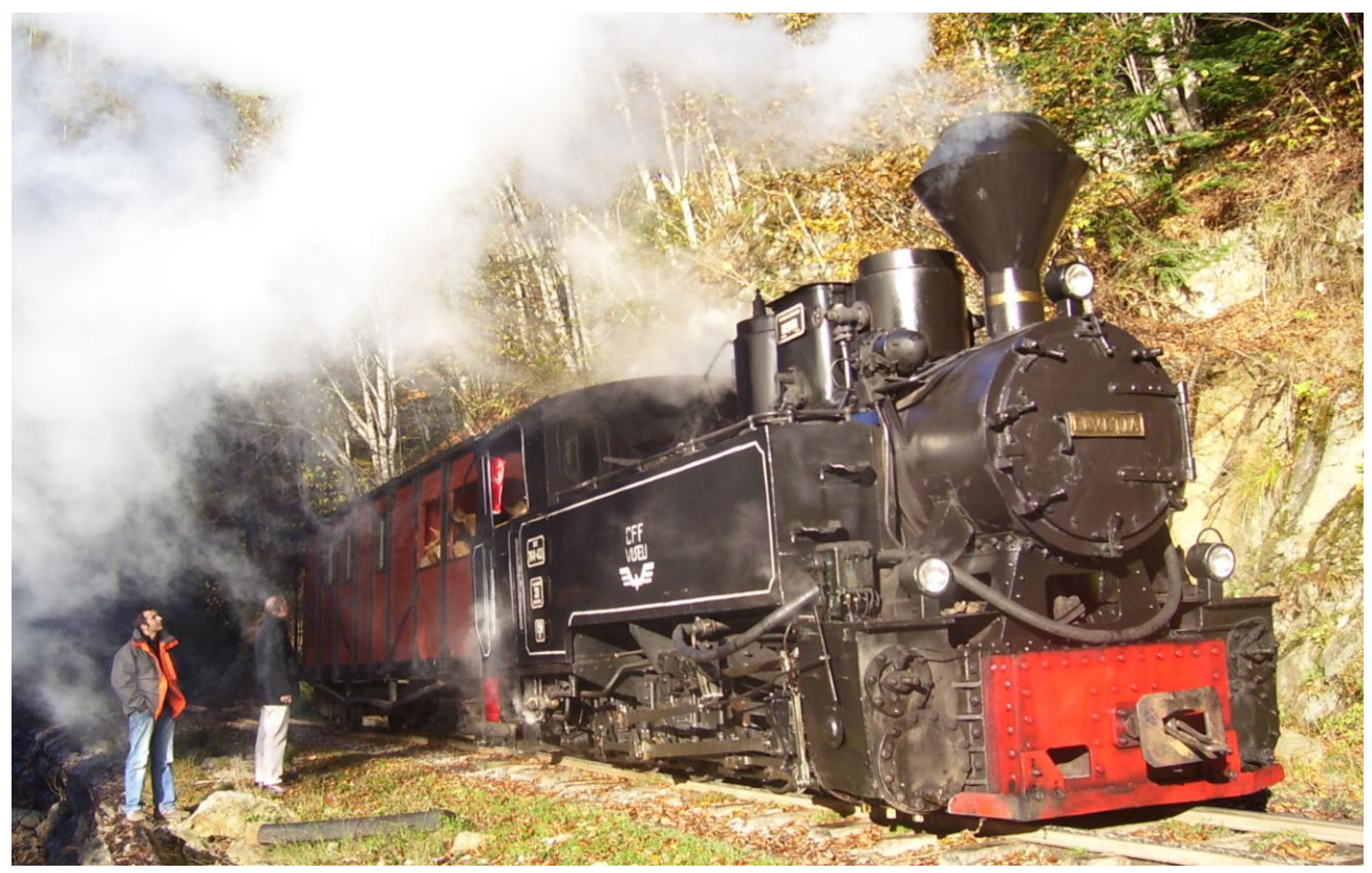
Special train on the Viseu de Sus line

Most definitely the biggest tourist attraction of all Romanian narrow gauge railways, the Viş eu de Sus railway started its life as a mountain forestry line back in 1933. While it still serves this purpose, in fact it is the last forestry line operating in Romania, tourist trains were introduced in the mid 90s thanks